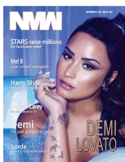
Volume 19 No. 5