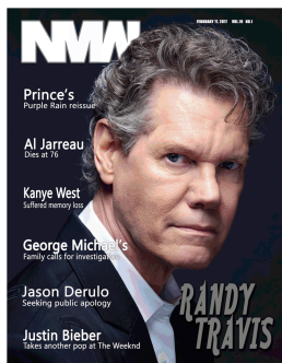
Volume 19 No. 1