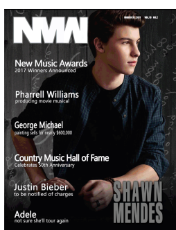
Volume 19 No. 2