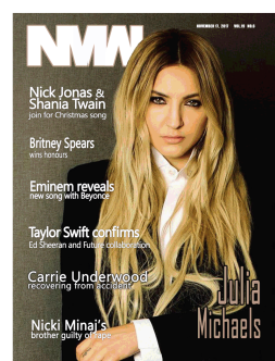
Volume 19 No. 6