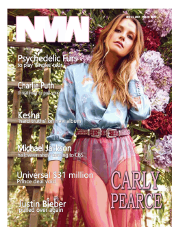
Volume 19 No. 4